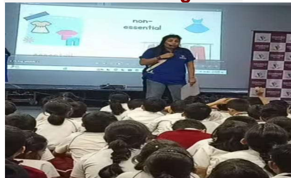
Financial Literacy Workshop by Young Indians