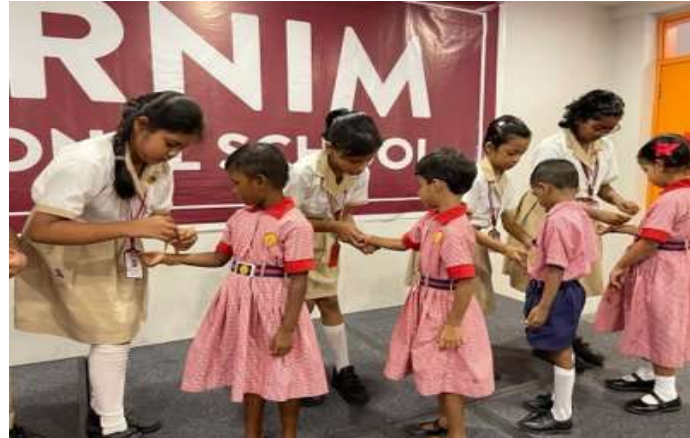
Rakhi Celebration with Help Us Help Them