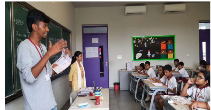
Workshop by Edudigm