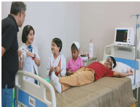
Montage Annual Exhibition