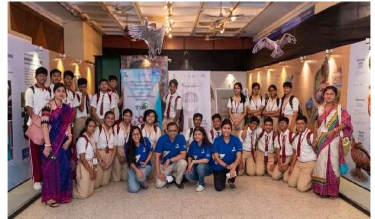
Visit to Birla Industrial and Technological Museum