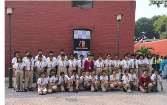
Tour to Alipore Jail Museum