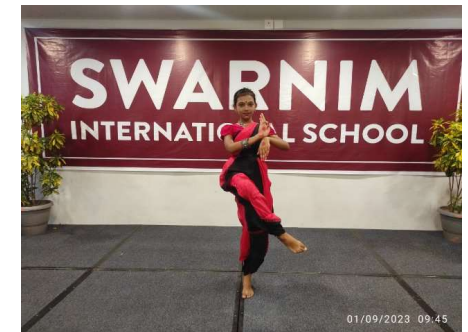
Inter-House Dance Competition