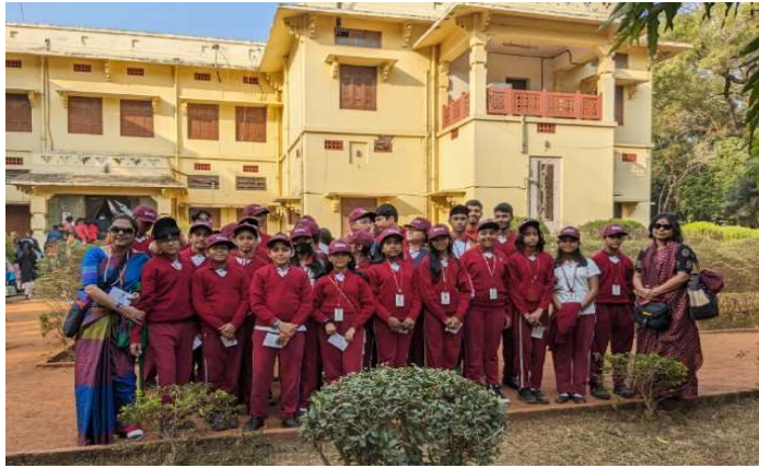
First Outbound Trip to Shantiniketan