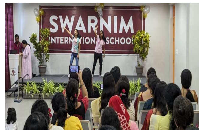
Teachers' Day 2023