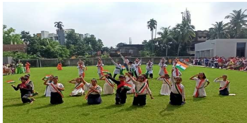
Independence Day 2023