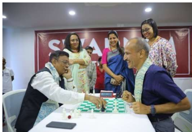
Chess One Day Tournament