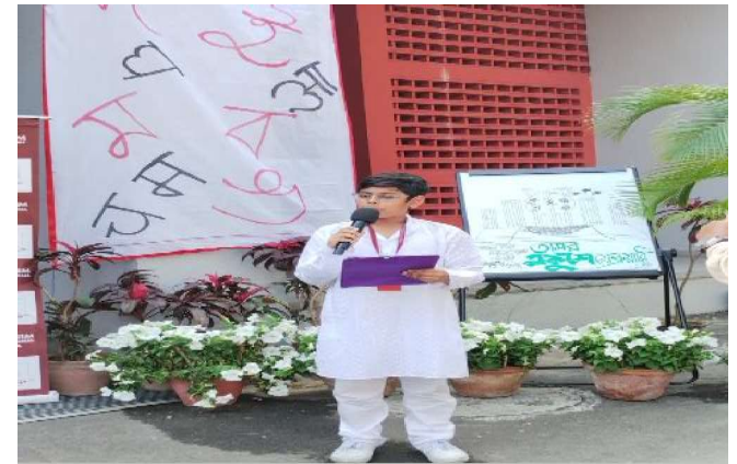
International Mother Language Day