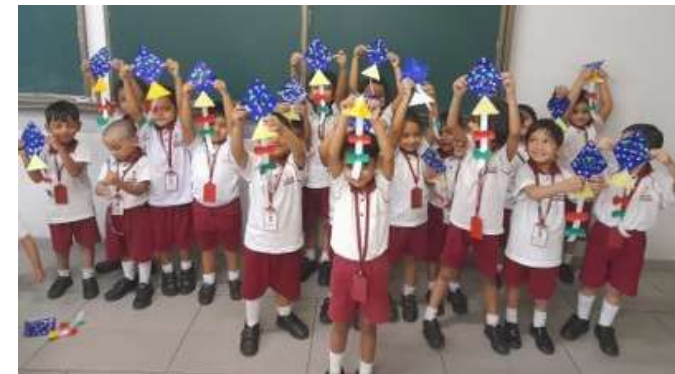
Vishwakarma Puja Activity