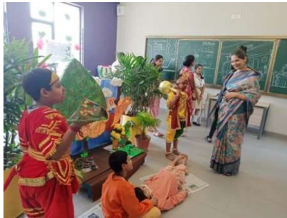
Montage Annual Exhibition 2023