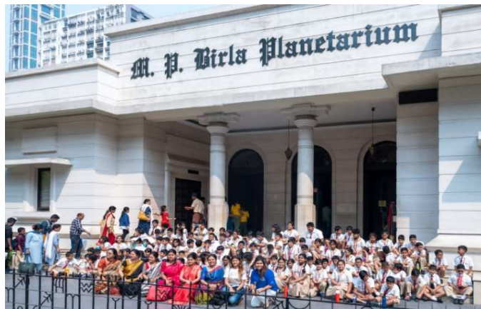
Visit to Birla Planetarium