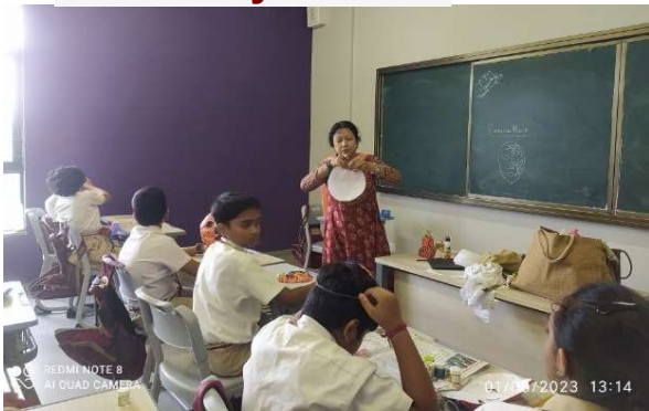
Art & Craft Workshop by Pidilite