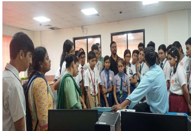
STEM on Wheels- A visit to IIT Kharagpur