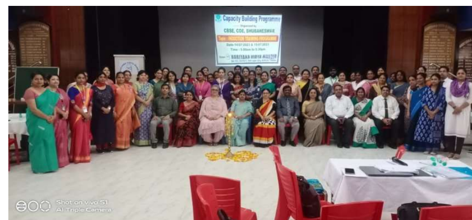
CBSE Induction Workshop