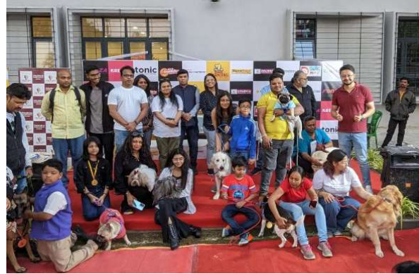
Pet Show – Dog Carnival