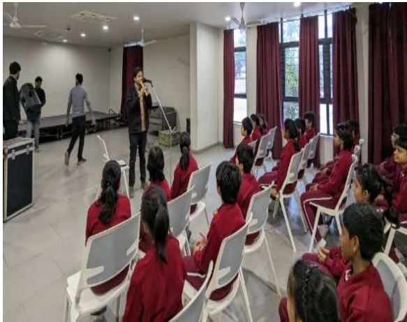
Music Workshop for Students by Yamaha